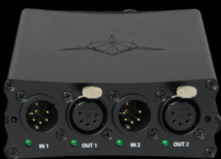
LS NODE 2 DMX512 XLR5 2x Input / 2x Output