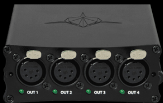
LS NODE 4 DMX512 XLR5 4x Outputs

LS NODES is the perfect tool for lighting signal distribution.