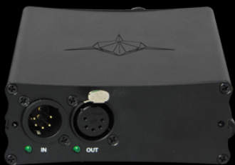
LS NODE 1 DMX512 XLR5 Input / Output